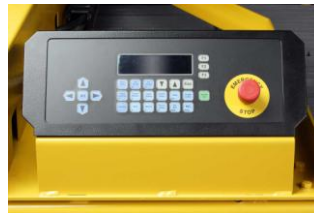
AMC4 CNC Controller with graphic display